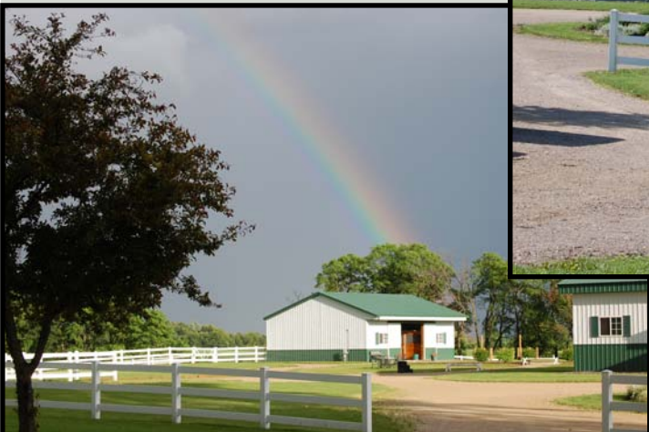
(Left) A rainbow appears over the guest barn. The full-size outdoor arena is in-between the guest and main barn.