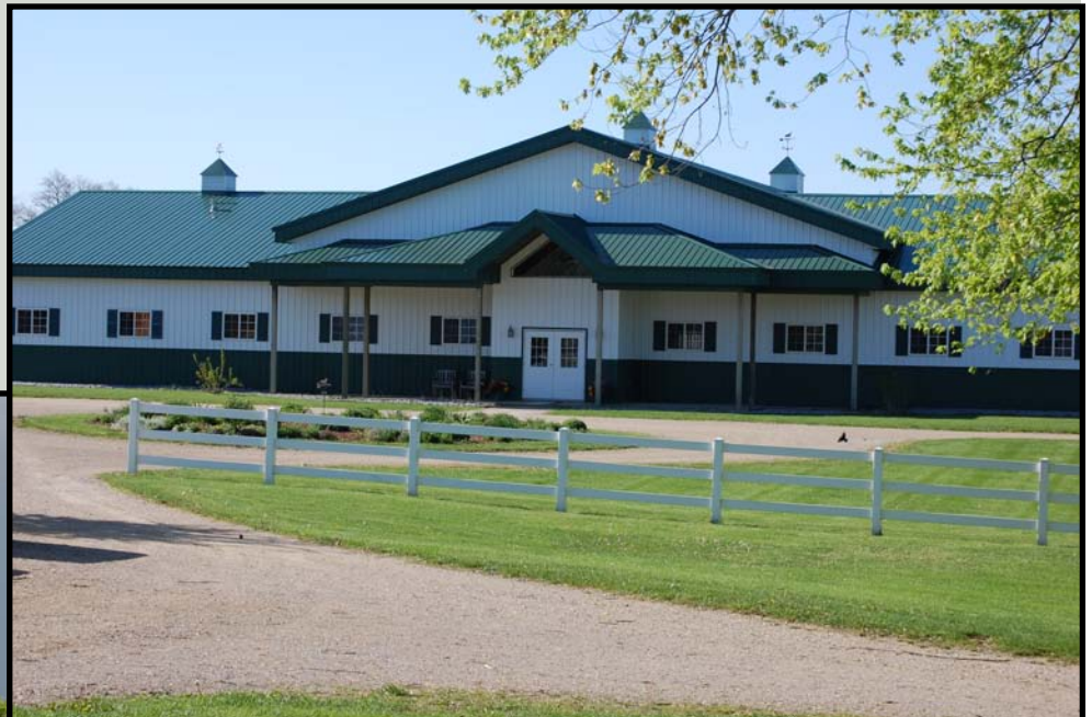
(Top) Front of Paradigm Farm's main barn. Indoor arena is attached.