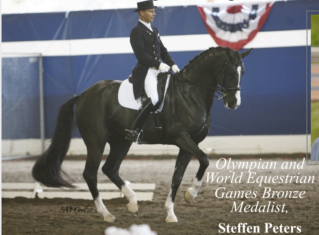
Olympian and World Equestrian Games Bronze Medalist, Steffen Peters