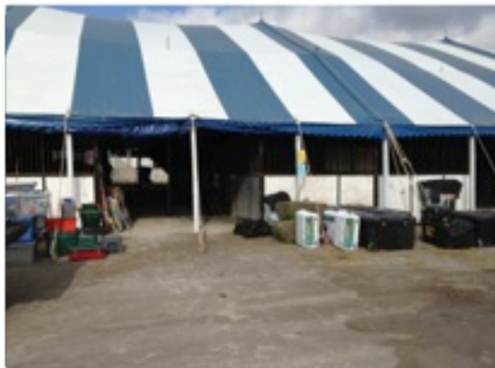
Packed up and ready to head home.