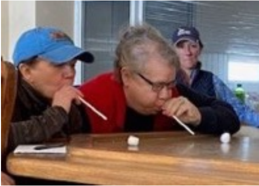
A competition to test core muscles used for breathing. It involved who could blow a cotton ball the farthest.