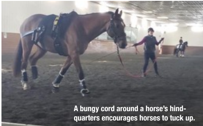
A bunge cord around a horse's hind-quarters encourages horses to tuck up.