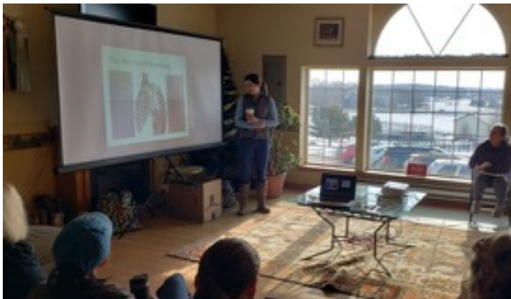
Explaining core muscles, among other concepts, during the presentation in the lounge at Rosebury Farm.