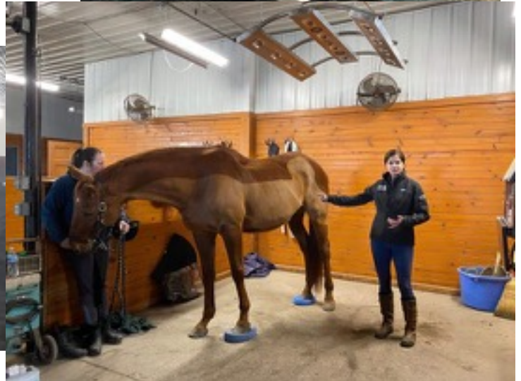
(Above) Strengthening a horse's muscles by standing on pads laterally and (below) behind.