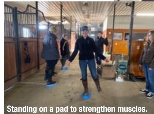
Standing on a pad to strengthen muscles.

if you breathe using your chest, you are lifting your shoulders. We had a