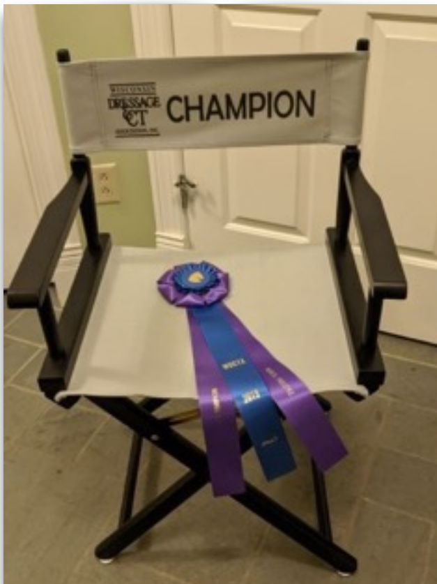
The 2019 WDCTA awards include (left) a director's chair for champion, (right) an etched glass vase for reserve champion, and (below) a saddle pad for maiden champion.

(Note: Photos of award winners were submitted by the riders/owners.)