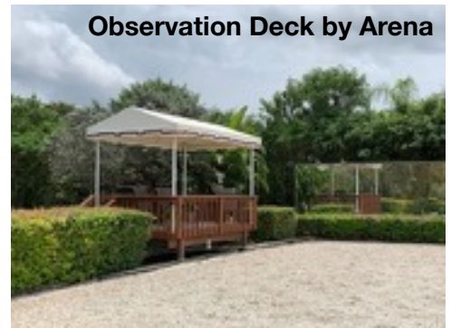
Observation Deck by Arena