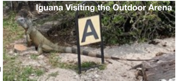
Iguana Visiting the Outdoor Arena