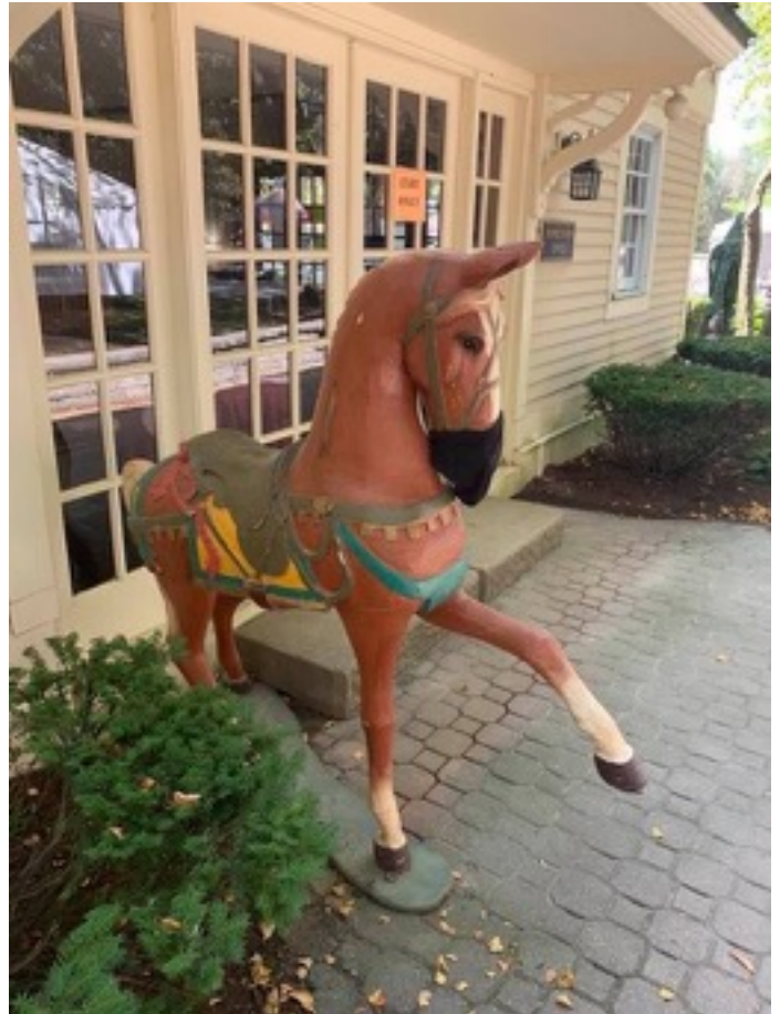
Even the horse statue at Lamplight Equestrian Center wears a mask.