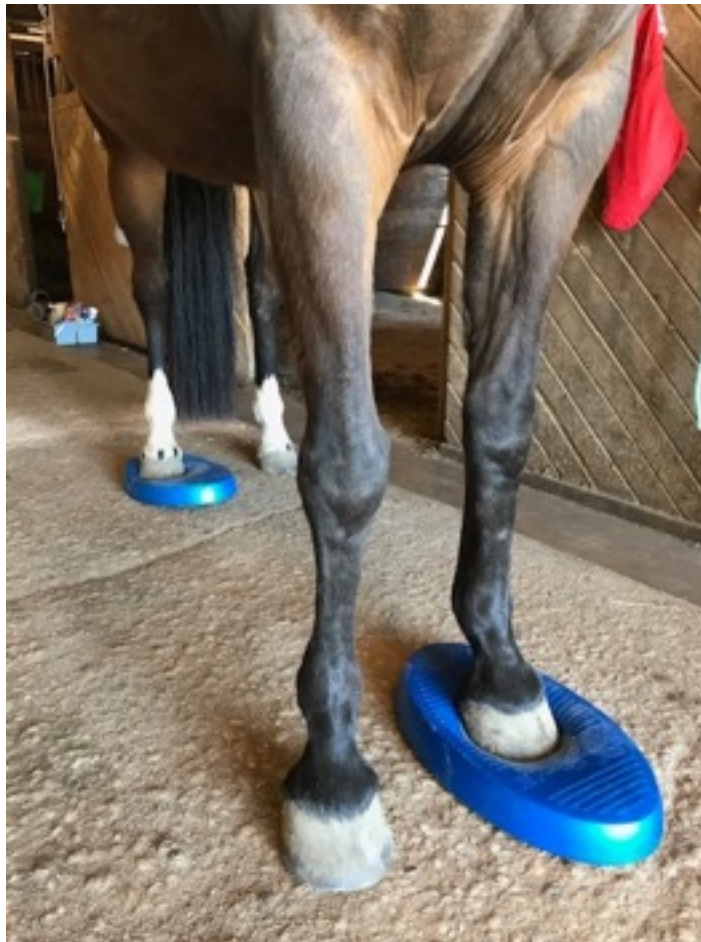
Molly on the balance pads used diagonally to help her.

Week 22, now the end of May, was an exciting week for us as Molly’s physical therapy increased to a new level with work on the lunge line! Still incorporating all of her core exercises throughout the week, we added three days per week of: 10 minutes of walk, 30 SECONDS at trot followed by 60 SECONDS of walk. We did two sets of these in each direction followed by a five-