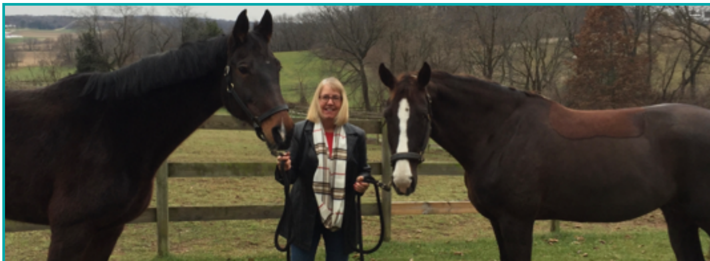
One of my favorite photos taken about six years ago of Diamond Dureza (right) with her dam, Salope, who taught me so much and, as a bonus, gave me "Zeza," my wonderful partner who keeps me having so much fun in this sport (and on trails).

Plain and strawberry Greek yogurt and pinot grigio wine! (I keep the chocolate in the cupboard.)