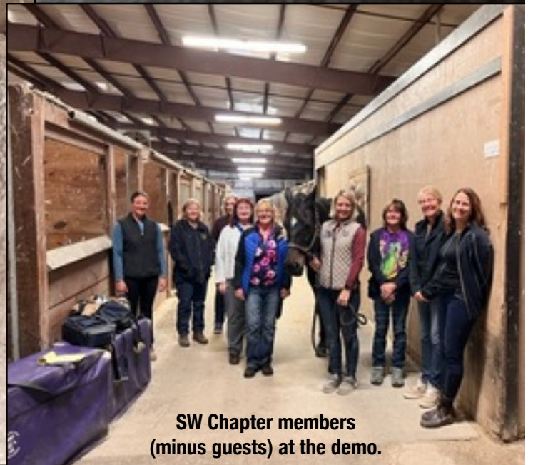
SW Chapter members (minus guests) at the demo.