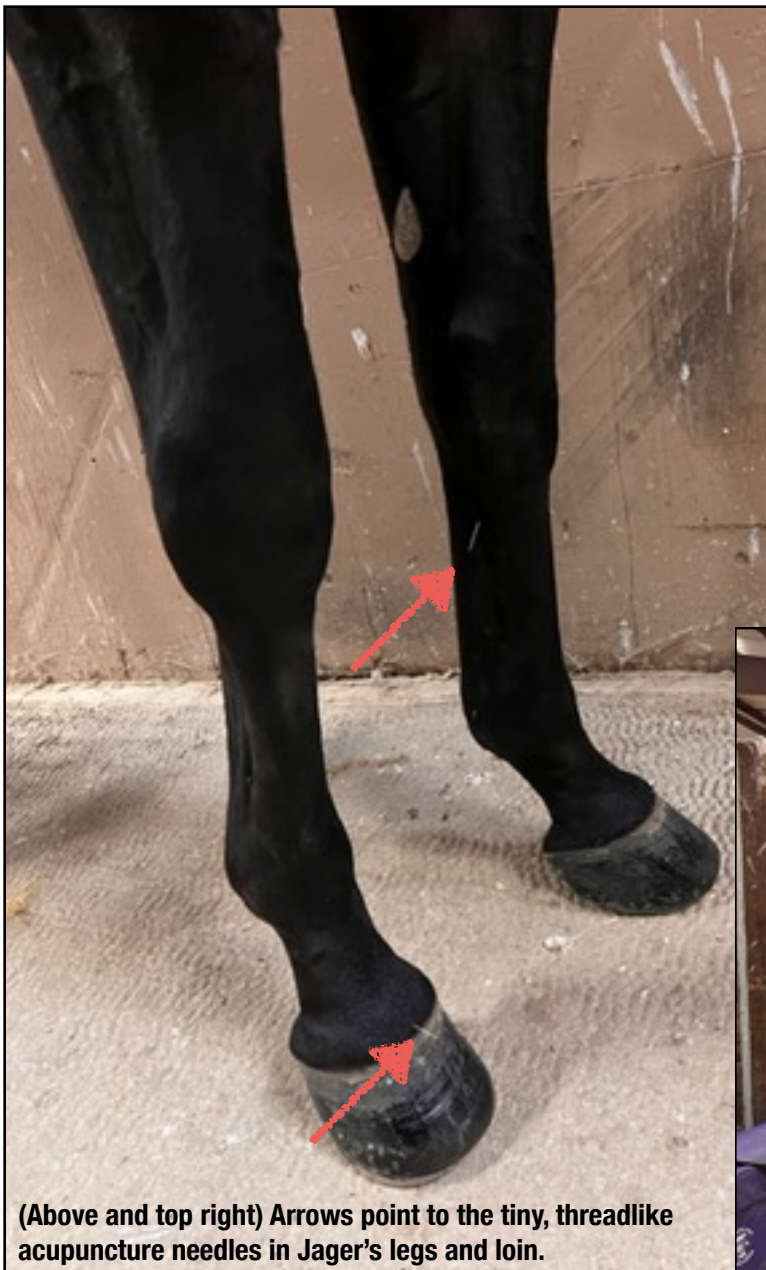
(Above and top right) Arrows point to the tiny, threadlike acupuncture needles in Jager's legs and loin.