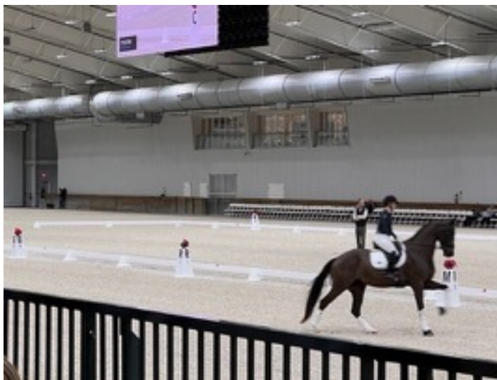
Carl Hester talking to the audience and working with a rider on a young horse in one of the facility's many indoor arenas.