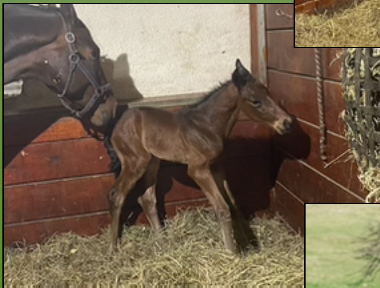
(Above) Sire: Herzensdieb — Dam Sire: Fuerstenball