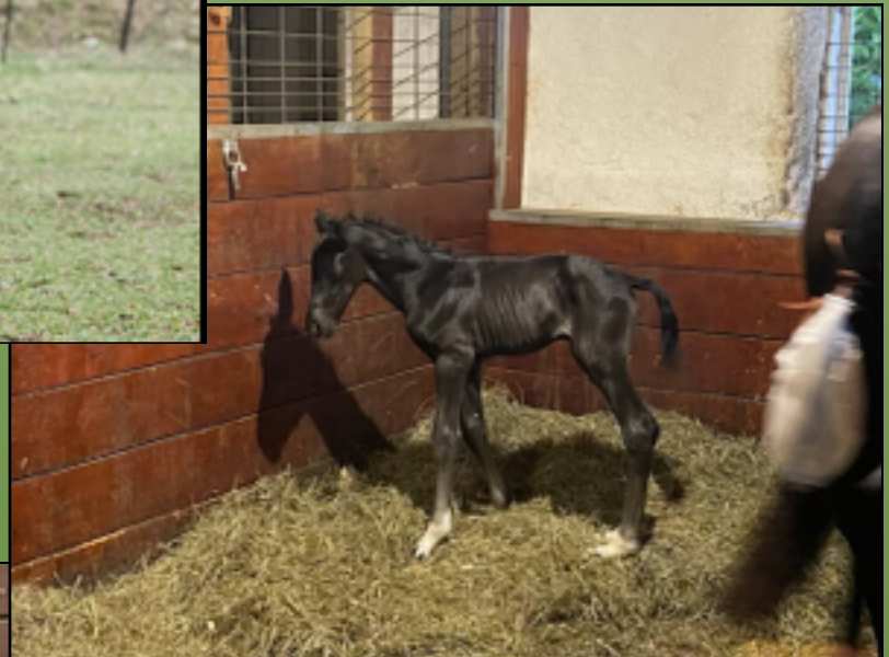
(Above) Sire: Hampton — Dam Sire : Danciano)