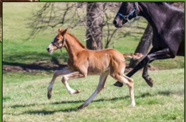
(Right) Sire: Sir Donnerhall — Dam Sire: Belissimo M