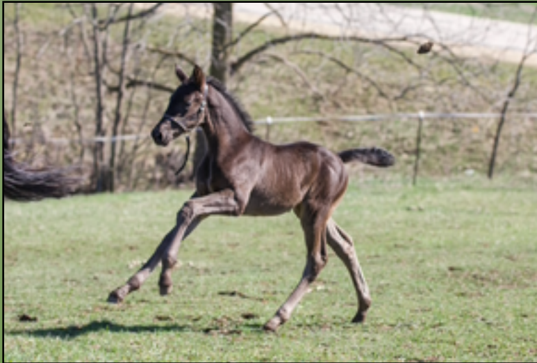
(Above) Sire: Glamourdale — Dam Sire: Fuersten-Look