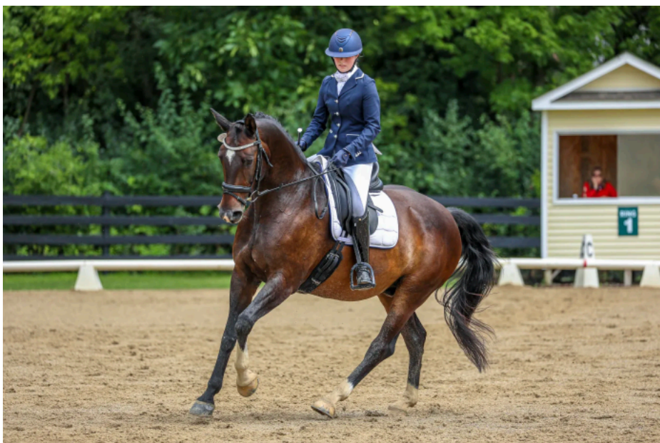
Madeleine and Monet's Masterpiece.