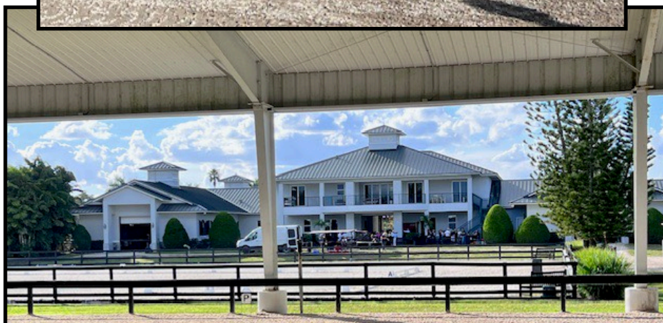
(Top) The entrance to the Helgstrand Farm with its beautiful horse stastues. (Bottom) Looking at the back of the barn from the covered arena.

freer and more supple was very educational. To be fair, some of the horses were very green in an environment with 200 people sitting around the arena, and I very much appreciated how these riders (all women!) bravely handled the power, tension and/or exuberance.