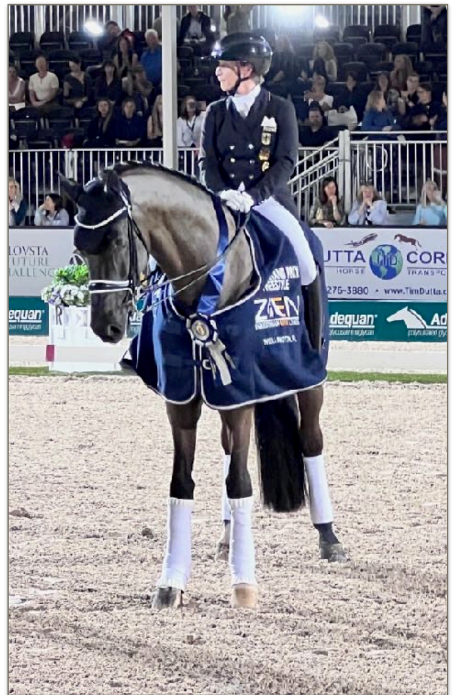
Isabell and So Perfect in the awards ceremony at the Global Dressage Festival. The two won the Grand Prix and the Grand Prix Freestyle classes.

From shoulder-in she moved to half-pass. She said it is essential that the rider makes sure the horse first has a